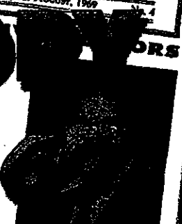
RALPH DALL AS 304