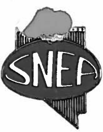
Exhibit F State of Nevada Employees Association

Post Office Box 1016 — Carson City, Nevada 89701 — (702) 882-3910