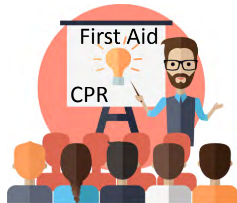
Increased Training Costs