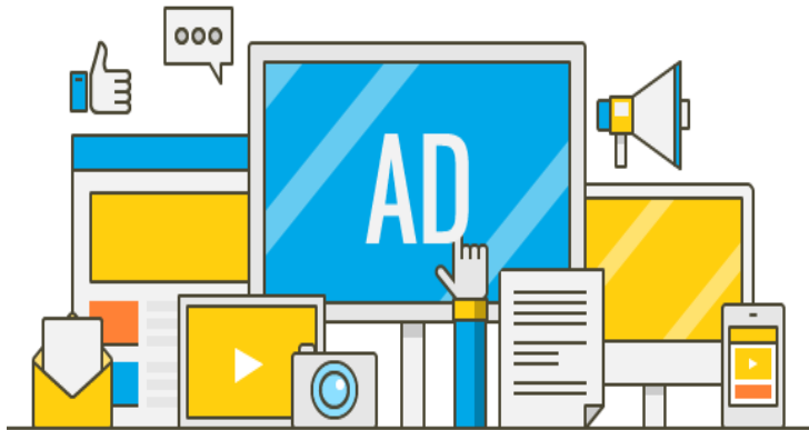
Increased Recruiting Costs