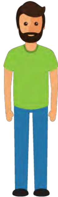
Direct Support Professional