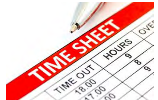
Daily Overtime, Min Wage Increases and 24 hour Care