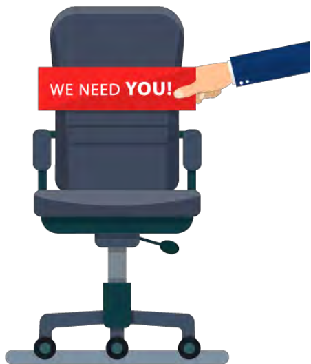
75% to 100% Turnover