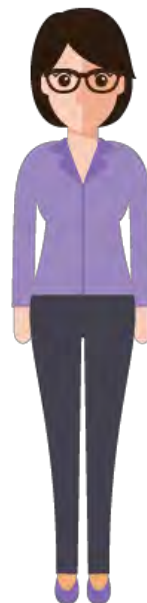
Private Service Provider