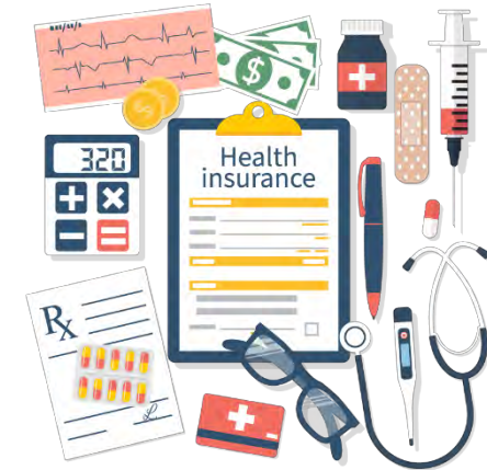
Health Insurance Laws & Increases