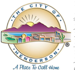
EXHIBIT F Senate Committee on Government Affairs Date: 2-18-2015 Total pages: 1 thru: F1 Exhibit begins with: F1

City of Henderson Community Development and Services Geographic Information Services 240 Water Street P.O. Box 95050 Henderson, NV 89009-5050 Tel. (702) 267-1500 www.cityofhenderson.com